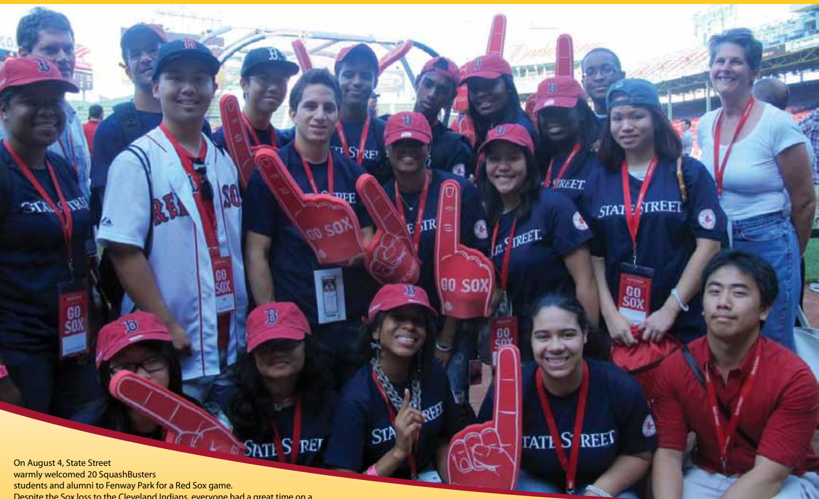
On August 4, State Street warmly welcomed 20 SquashBusters students and alumni to Fenway Park for a Red Sox game. Despite the Sox loss to the Cleveland Indians, everyone had a great time on a perfect summer evening at Fenway. Many thanks to State Street for providing this opportunity!