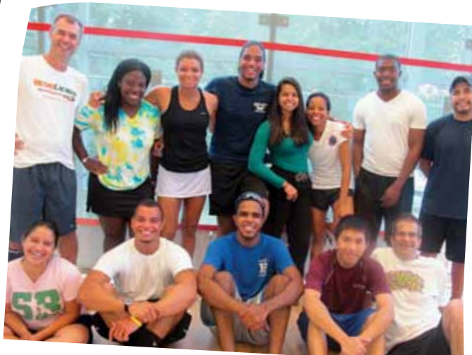
SquashBusters staff and alums relax after a hard night of on-court competition.